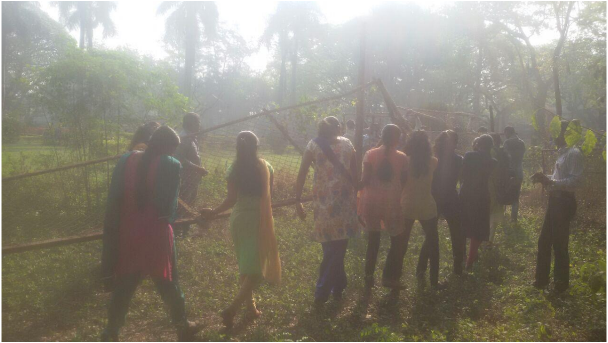
Special work of 'Butterfly Garden ' in Hutama Garden