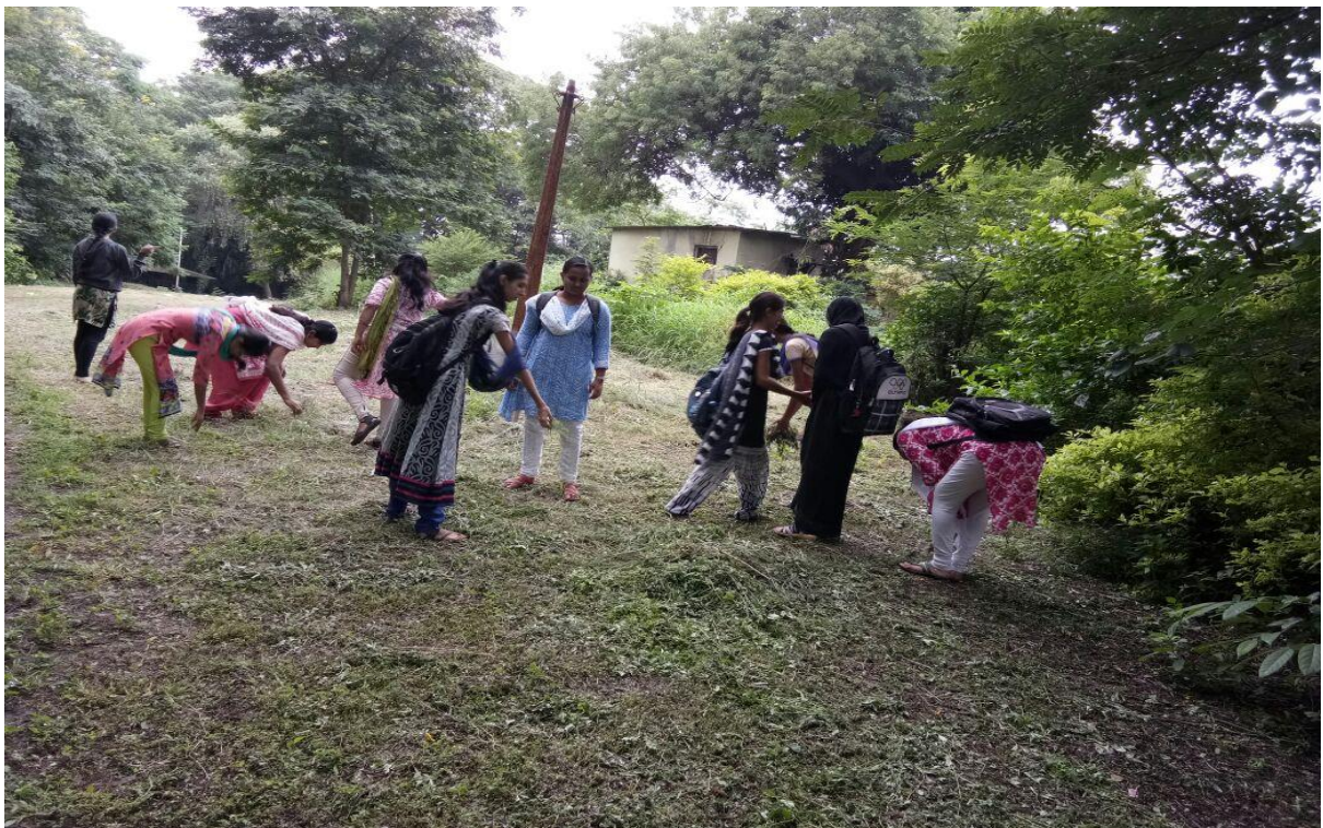
Cleaning premises in Huttama Garden.