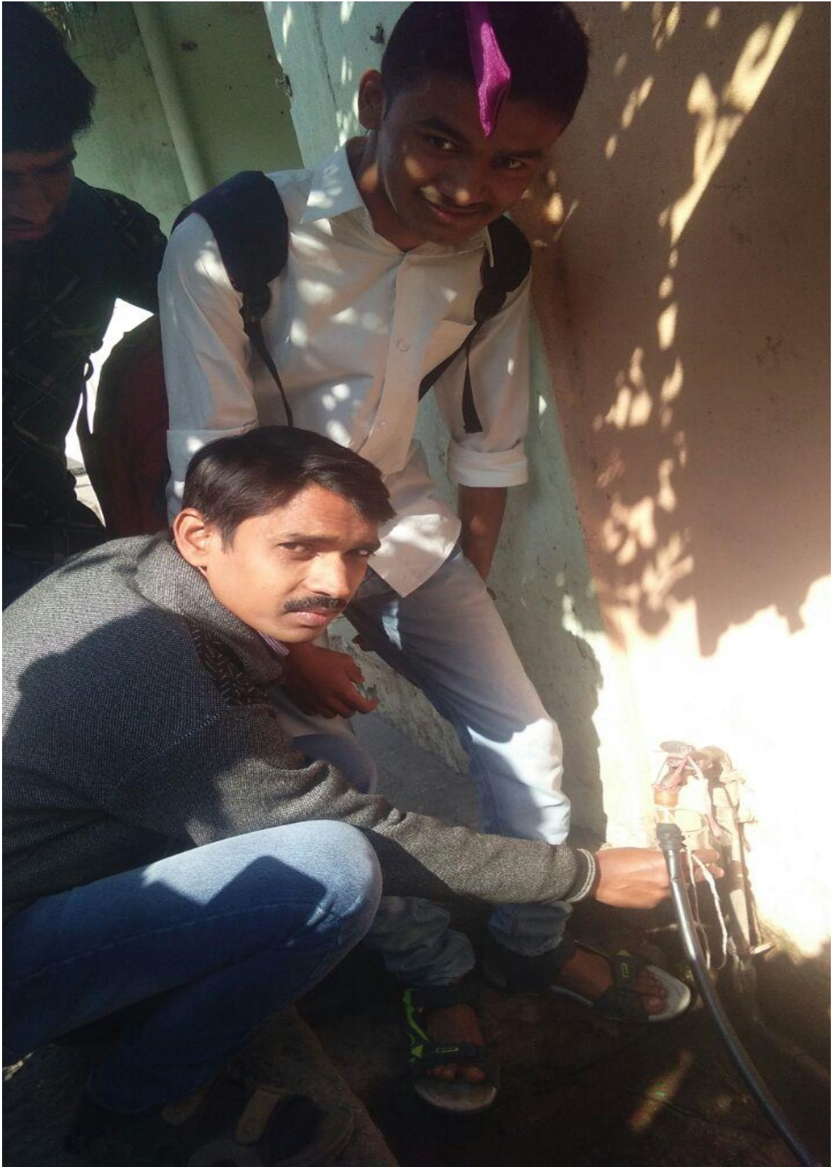
'Save water Save earth' Programme.